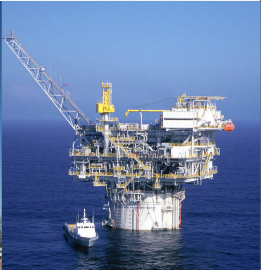
An oil rig on water.

We drill to get the oil from the ground. Some wells are on land and some are below water.