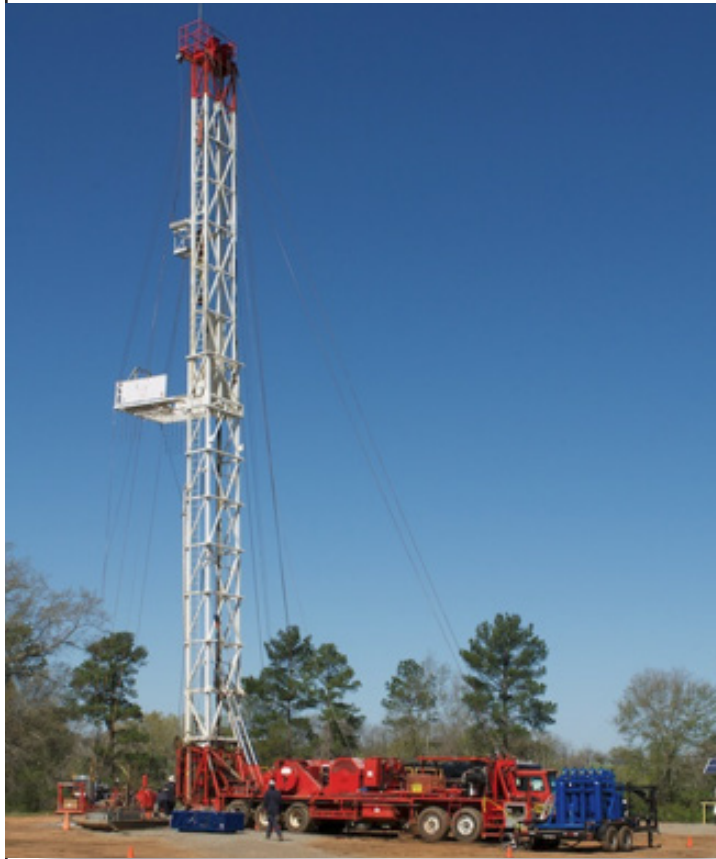
An oil rig on land.