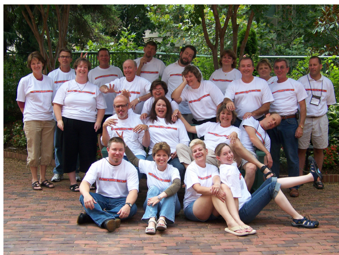
Energetic participants at NEED's master trainer workshop in July.

Also in July, NEED sponsored its first Facilitator Training in Alexandria, VA. Twenty-five participants attended the training designed to prepare teachers and staff to conduct NEED workshops in their local areas.