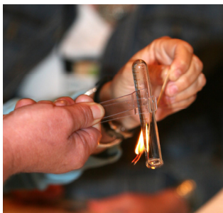
Testing for hydrogen using hands-on H 2 Educate kits.