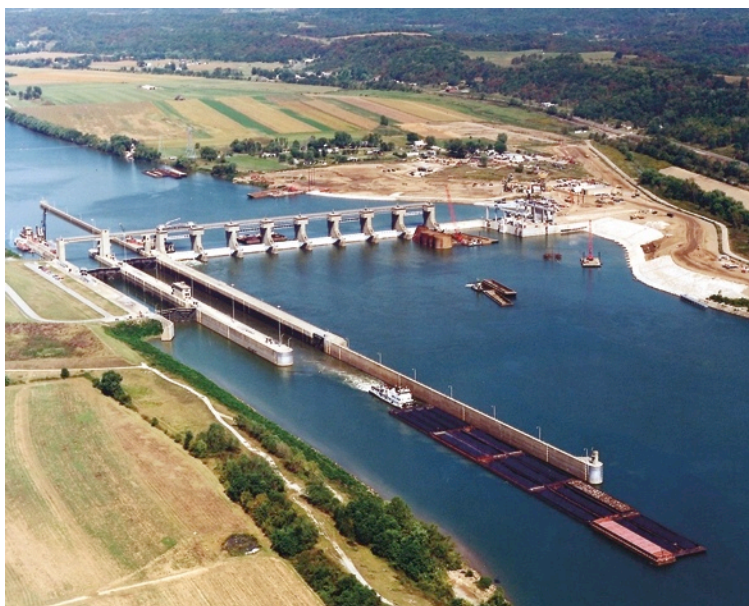
The inland waterways system includes 12,000 miles of commercially navigable channels and approximately 240 lock sites.

On the other hand, the industry is certain to undergo some change as many of the ports and waterways used today are in need of renovation. For example, more than half of the country's lock sites (devices that use gravity to raise and lower boats between stretches of water of different levels, making a river more easily navigable), which handle more than 630 million tons of freight every year, are more than 50 years old, putting them beyond their economic design lives. Unless these locks can continue to operate, the reduced use of the waterways will lead to cargo shifts to trains and trucks, resulting in more traffic on the roads, more fuel used, and an increase in pollutants into the air. Modernizing the waterways' infrastructure is a major need in the coming years, leading to even more opportunities for careers in the waterways field.