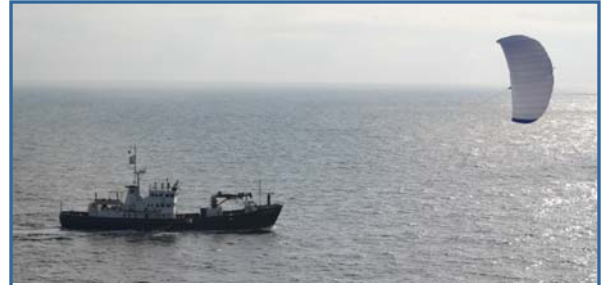
Testing SkySails on a cargo ship.

Global trade routes are used mostly by cargo ships that rely on diesel fuel to operate. With the increasing price of petroleum, companies are looking for innovative ways to reduce fuel costs. SkySails, a German company, has just completed a pilot voyage of an auxiliary propulsion system that could save 10 to 35 percent in fuel using wind power. Basically a large kite, a SkySail is deployed from the deck to tow the ship. The maiden voyage showed that the cargo ship outfitted with a SkySail could save up to $2,000 per day in fuel. For more information, go to www.skysails.info/index.php .