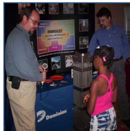
A NEED student explores energy careers with Dominion during a Passport to Energy Careers.