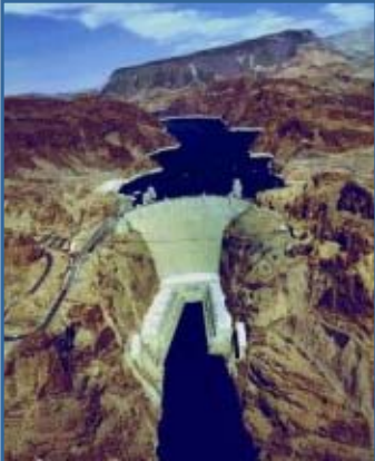
Hoover Dam