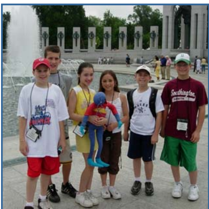
NEED students pose with EIA's Energy Ant at the WWII Memorial in Washington.

NEED thanks its teachers, student leaders, partners and sponsors for another great school year! We wish everyone a happy and energizing summer.