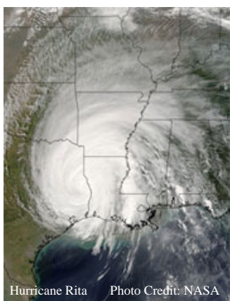
Hurricane Rita

Hurricanes Katrina, Rita, and Wilma affected not only the Gulf Coast, but also every home, school and business in America. The impact on energy prices will likely be felt for months to come.