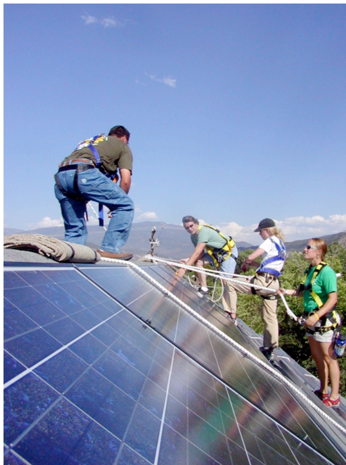
Many basic electrical skills are needed to install PV systems on a rooftop, but there are some things the average electrician might not do all the time, as these students are learning.

Putting these and other definitions of "green jobs" together, a few common themes emerge. One is that these jobs deal with protecting the environment and reducing energy use. Another is that these are jobs that offer solid opportunities for career advancement. In addition, the popular definitions usually make it clear that while some green jobs require very specialized skills, many require the same basic skills that are needed in traditional jobs. Additional experience and training can make these skills more applicable to green jobs. The Center for Energy Workforce Development (CEWD), for example, notes that an engineer who designs process flow in a conventional generating station can be trained to design emission control systems in the same station, or a worker who now installs air-conditioning systems can be trained to install efficient, energy-saving equipment. (continued on next page)