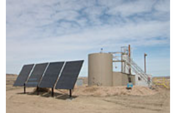
Solar powered oil shipping pump station in Wyoming.

For some time, solar power has been used for the control of oil and gas wells and pipelines. Now, the U.S. Department of Energy's National Renewable Energy Laboratory (NREL) and the Rocky Mountain Oilfield Testing Center (RMOTC) are testing the use of a photovoltaic (PV) array for the production and delivery of oil. The PV array provides electricity to shipping pumps that move the oil to a central collection point. According to NREL, in one month the PV array provided the energy to ship 286 barrels of oil. For more information, visit www.nrel.gov/solar .