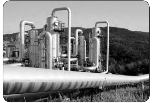
Natural gas is transported through pipelines.

The natural gas is piped from the wells to machines that clean it and remove any water. An odor like that of rotten eggs is added to the gas so that leaks can be detected.