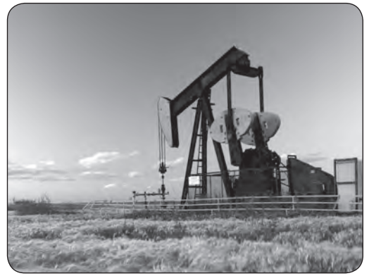
An oil rig pumps oil from a well.

A lot of oil is under the oceans along our shores. Oil rigs that can float are used to reach this oil. Most of these wells are in the Gulf of Mexico.