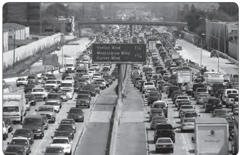
Petroleum fuels can contribute to air pollution.

Oil can pollute soil and water, injuring the animals that live in the area. Oil companies work hard to drill and ship oil as safely as possible. They try to clean up any oil that spills.