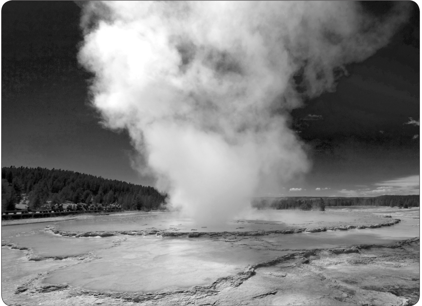
A geyser releases hot water and steam into the air.

Geothermal energy is heat inside the Earth. Geothermal energy is renewable.