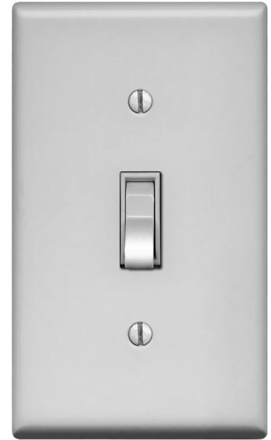
When you leave a room, remember to turn the lights off.

If the air conditioner is on, keep doors and windows closed. Don't go in and out, in and out. If you can, just use a fan and wear light clothes instead of using the air conditioner.