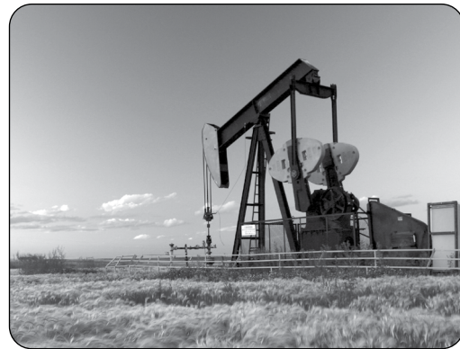
An oil rig pumps oil from a well.

A lot of oil is also under the oceans along our shores. Floating oil rigs are used to reach this oil. Most of these wells are in the Gulf of Mexico.