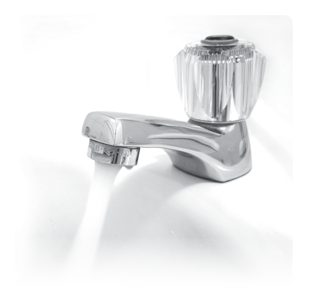
Turn off the water while you brush your teeth.