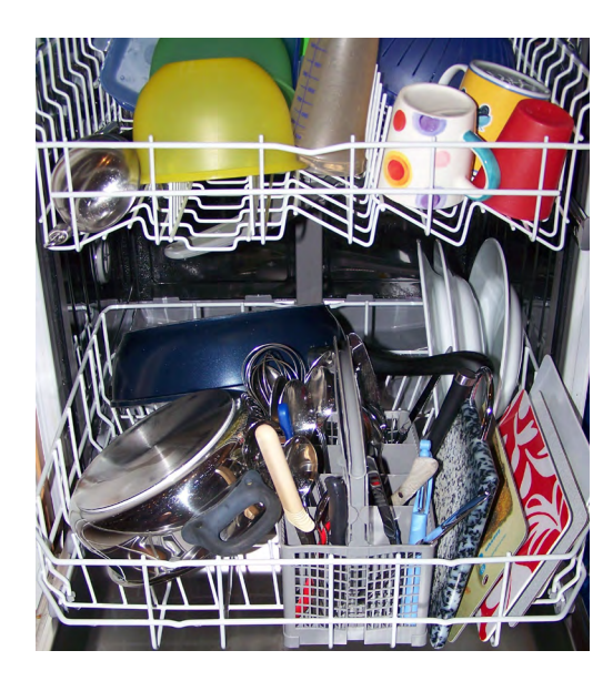
Make sure the dishwasher is full before turning it on.