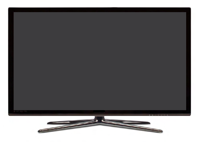
Turn off lights, televisions, radios, computers, video games, and other machines when you leave the room.