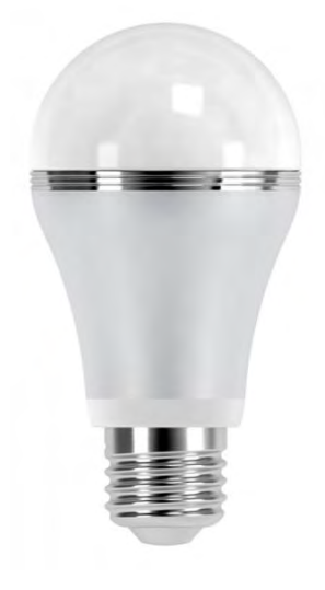
Use energy-saving LED bulbs. They save energy and money.