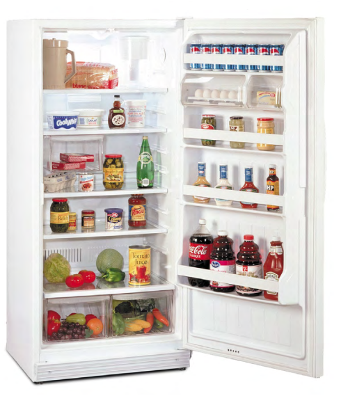
Decide what you want before opening the refrigerator door.