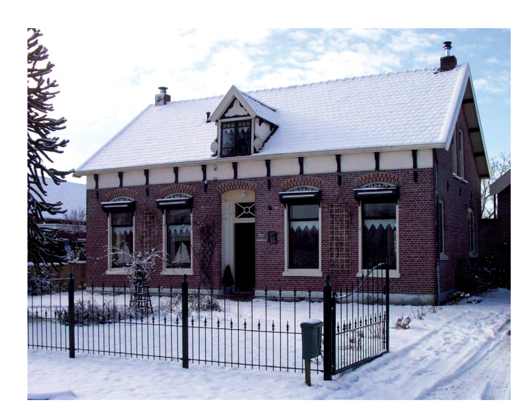
Keep windows and doors closed when heating or cooling a home.