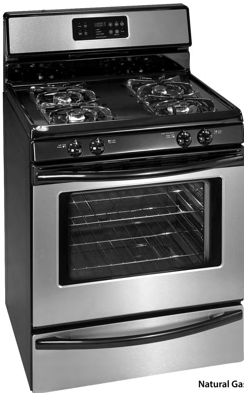
Natural Gas Stove

We burn natural gas for heat. It can cook our food and warm our homes.