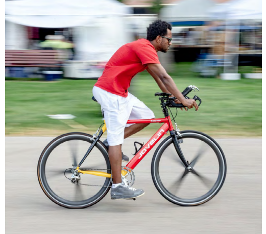
Ride a bike.