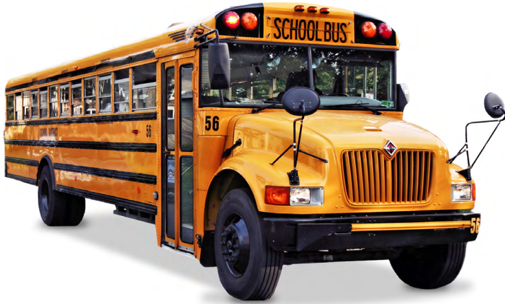
Ride the bus.