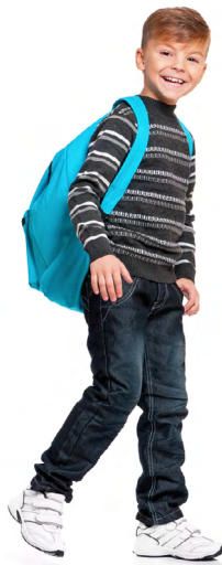
Walk to school.

When appropriate, save energy by using public transportation, riding your bike, or walking.